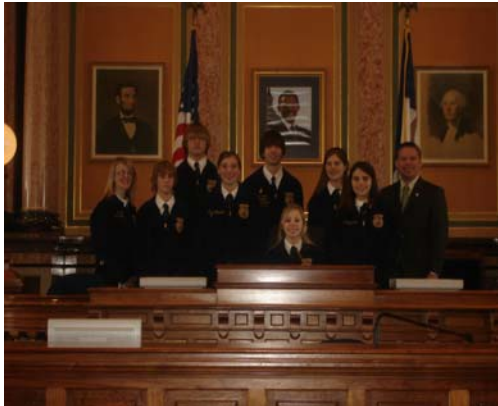
FFA students from Oelwein and Wapsie Valley

In addition to the $24 million for housing assistance, the bill also expands eligibility to more Iowans by raising the county median family income threshold for assistance from 100% to 150%. Preference will first be given to Iowans who